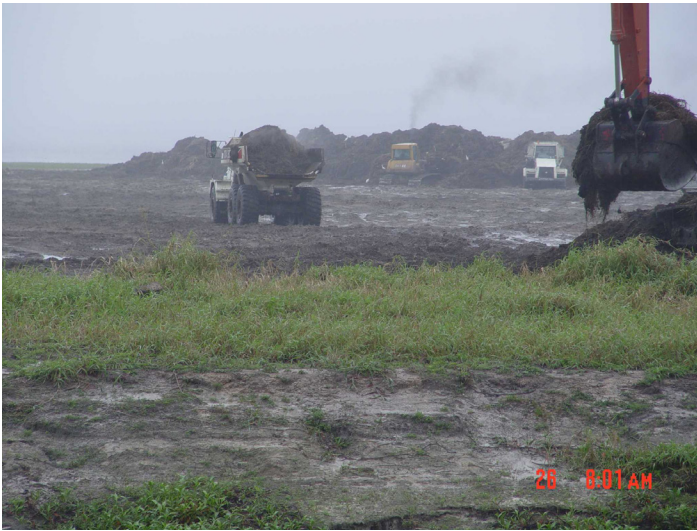
Figure 6. Heavy equipment moving muck during a lake restoration program for Lake Tohopekaliga, Osceola County, Florida.

When an aquatic plant management program is implemented or a water body undergoes substantial nutrient enrichment, the most frequent question asked by the concerned citizen is “how much muck do the aquatic plants produce?” A definitive answer is difficult to provide because so many environmental factors determine muck accumulation rates, but generally, algae produce the least muck, submerged macrophytes produce a little more than algae, and emergent, floating-leaf, and floating plants produce the most muck.