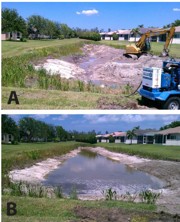
Figure 9. Picture of retention pond in Boynton Beach, Florida, before (a) and after (b) a small-scale dredging operations.

Sometimes people attempt to remove muck by hand using special rakes, shovels or hand dredges. This tedious, physically taxing approach is certainly not recommended