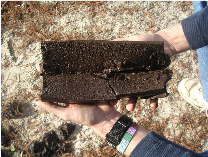
Figure 2. Mark Brenner holds a short section of a lake sediment core that was sliced lengthwise to reveal the consistency of deeper, consolidated, organic-rich mud deposits. The core was collected from Lake Lochloosa, north-central Florida.

Muck, to the non-scientist, is nothing more than the black or brown ooze on the bottom of lakes. The scientific community, on the other hand, distinguishes among various types of muck, depending on their origin and composition. One common characteristic, however, is the presence of a large amount (typically 20% to >80%) of organic matter.