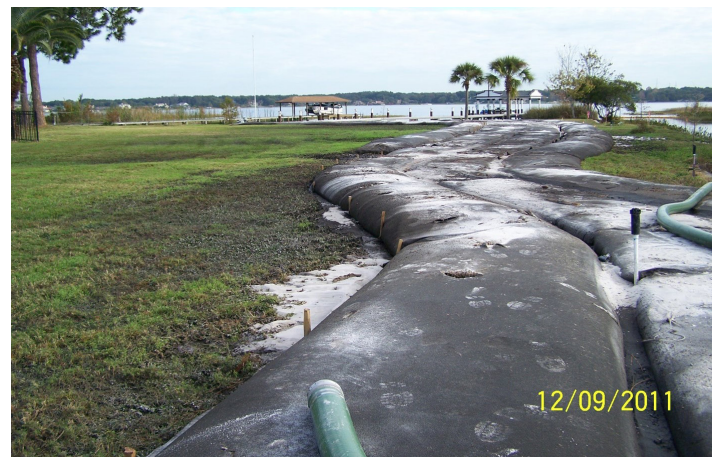
Figure 8. Large-scale muck removal using geofilter tube to dewater muck from Lake Down, FL.

The sediment slurry, once pumped into the settling basin, is allowed to settle, and the water, once cleaned of sediments to meet water quality standards, can often be returned to an aquatic system, unless it has been totally evaporated. Lack of land or the high cost of land in an urban area can preclude the use of large-scale suction dredging. If the water level in a water body can be lowered sufficiently to allow nearshore bottom sediments to dry, bottom muck can be scraped down to hard bottom using conventional