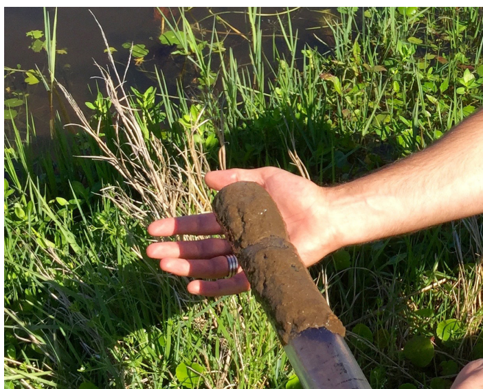
Muck from pond at Fisheries and Aquatic Sciences, Gainesville, FL.