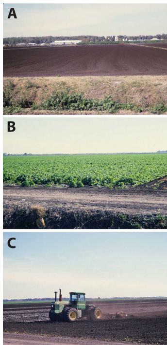
Figure 3. Pictures of Zellwood Muck farm located just north of Lake Apopka around 1987.