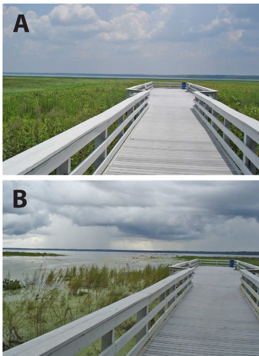
Figure 7. Photo of Lake Newnan taken during drought conditions (a, May 31, 2012) and after 6 + inch rainfall (b, August 22, 2012).

Mother Nature and time can also redistribute muck in shallow Florida systems when water levels rise after droughts. If a lake's water level is lowered sufficiently for plants to root but not to the point where the muck dries out, aquatic and terrestrial plants may root in the muck. Given sufficient time for the root systems to develop, floating islands (tussocks) will form when the water level rises. Wind can then push the islands over great distances. When that happens, muck can be deposited at locations far from where it was formed when the tussock settles or disintegrates. If the water rises sufficiently to flood the land beyond the shoreline, tussocks can float landward of the traditional shoreline. If these tussocks originated in shallow, nearshore waters, a sandy bottom will be seen when the water returns to its normal stage. This is another reason why some professionals do not recommend maintaining stable lake water levels. The primary question is how long people will wait for Mother Nature and time to do their thing!