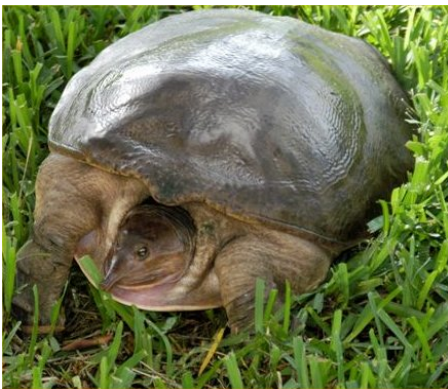
Florida Softshell Turtle Apalone ferox

Habitat : forests, hardwood hammocks, mangrove forests, dunes. Diet : insects.