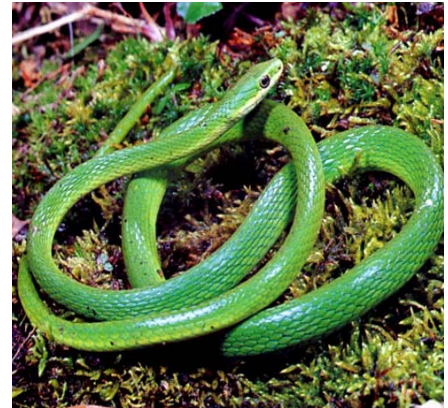
Florida Rough Green Snake Opheodrys aestivus carinatus

Habitat : meadows, prairies, hardwood hammocks. Diet : small worms, slugs, frogs, anoles, skinks, and salamanders.