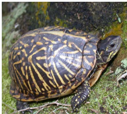
Florida Box Turtle Terrapene carolina bauri

Habitat : fresh or brackish water with mud or sand bottoms. Diet : aquatic insects, crabs, fish, amphibians, birds.