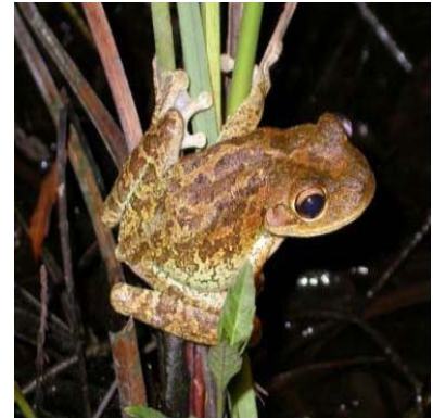
Cuban Tree Frog Osteopilus septentrionalis