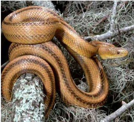
Yellow Rat Snake Elaphe obsoleta quadrivittata

Habitat : swamps, trees, buildings. Diet : rodents, birds, small eggs.