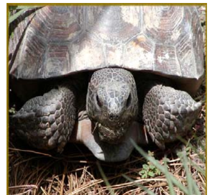
Gopher Tortoise Gopherus polyphemus

Habitat : forest and marshes. Diet : insects, worms, and some plant material.