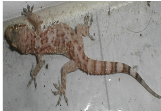
Common House Gecko Hemidactylus frenatus

Diet: insects, spiders, and other invertebrates.