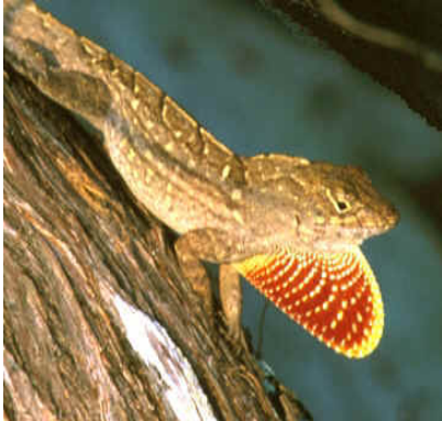
Cuban Brown Anole Anolis sagrei sagrei

Habitat: lives in savanna, on the edges of forests, in desert areas, and is very common in urban areas. They perch on bushes, at the bases of large trees.