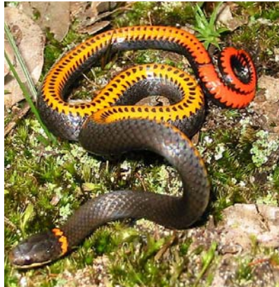
Southern Ringneck Snake Diadophis punctatus punctatus

Habitat : swamps, trees, buildings. Diet : rodents, birds, small eggs.