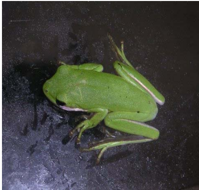
American Green Tree Frog Hyla cinerea

Habitat : lakes, farm ponds, floodplains, wetland and swamps.