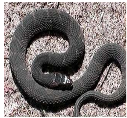
Banded Watersnake Nerodia fasciata fasciata

Habitat : freshwater ponds, lakes, streams, marshes.