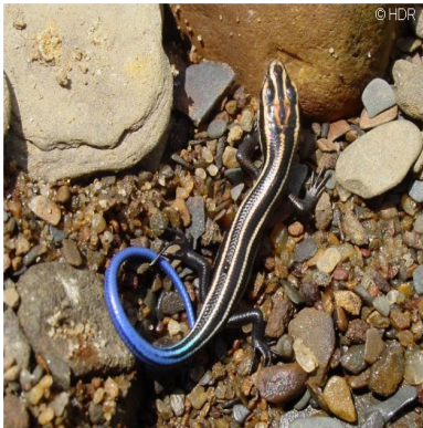
Five-lined Skink Eumeces fasciatus

Habitat: swampy forests, ravines, under rocks, stumps or wood piles.