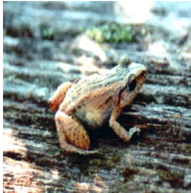
Green House Frog Eleutherodactylus planirostris

Diet : insects and other small invertebrates.