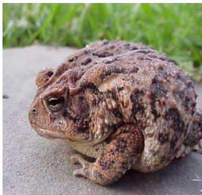
Southern Toad Bufo terrestris

Habitat : sandy areas, cultivated fields, pine barrens and hammocks.