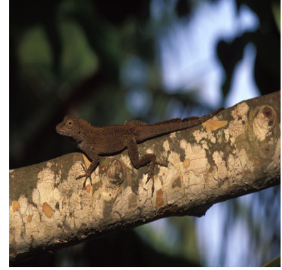
Crested Anole Anolis cristatellus cristatellus

Diet: grubs, crickets, cockroaches, spiders, moths, any arthropod that will fit in their mouths.