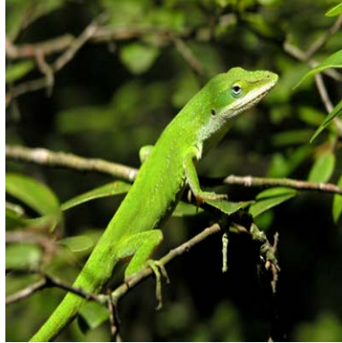
Green Anole Anolis carolinensis

Habitat: found in bushes, trees (not above 15'), in and on rock walls, woods, around houses.